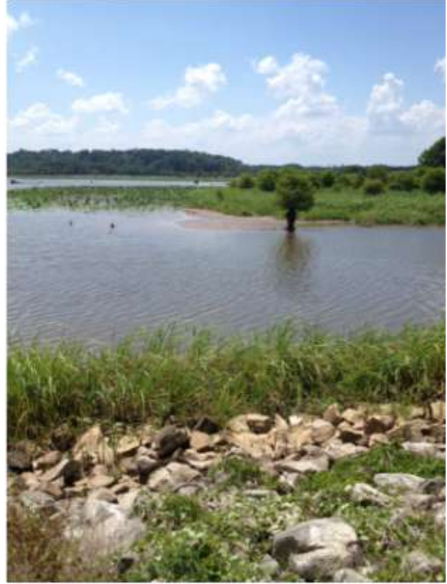
Summer drawn-down of Bluff Lake exposes lotus and sand bars. Levels will return to full pool in the fall, hopefully with fewer lotus plants. Spraying is currently underway.